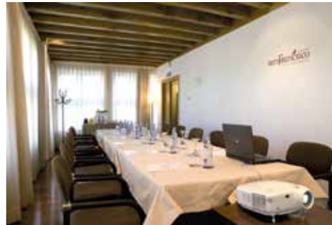
Galería I and II Rooms