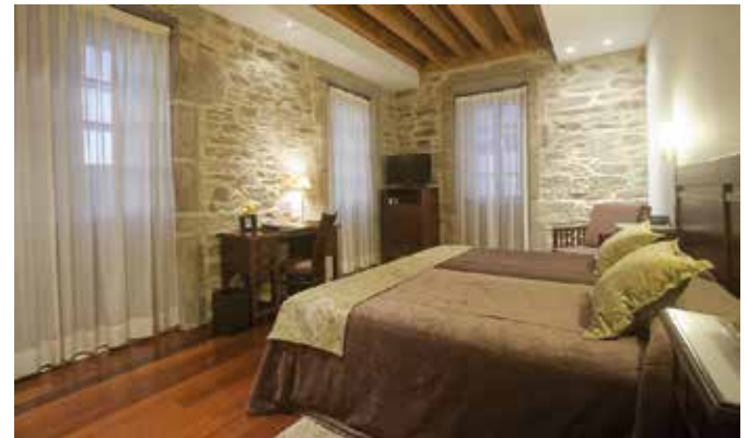
A room in the hotel