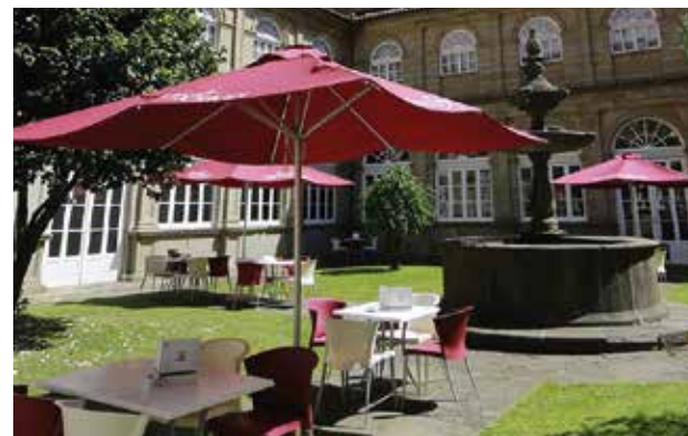
Terrace in the cloister of the fountain