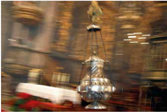
Botafumeiro (Giant Incense Burner)