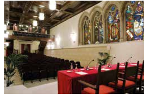
Carlos V Auditorium

Contact information: eventos@sanfranciscohm.com Tel.: 981 58 16 34