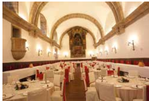
Banquet in the Monumental Dining Room