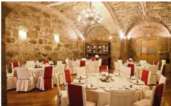
Wine cellar dining room