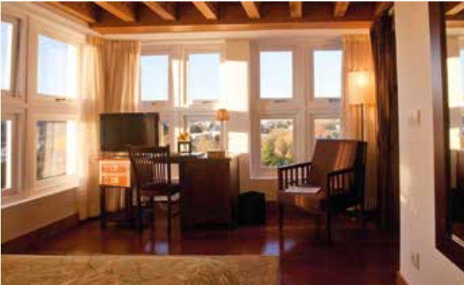
A room in the hotel