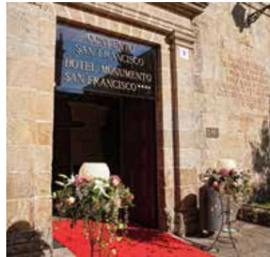
Decoration at the Main Entrance