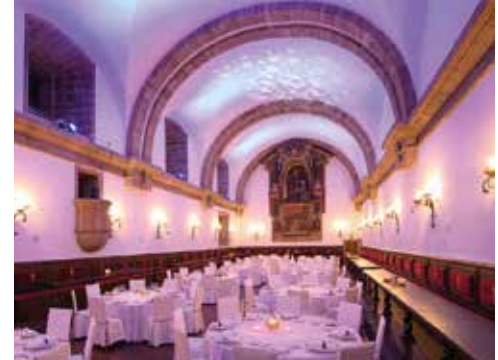
Monumental dining room