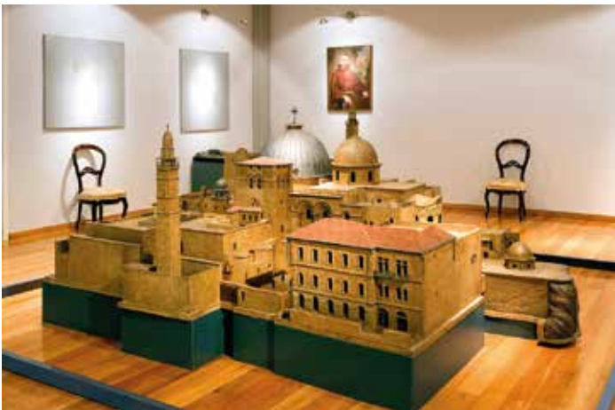
Model of the Basilica of the Holy Sepulchre