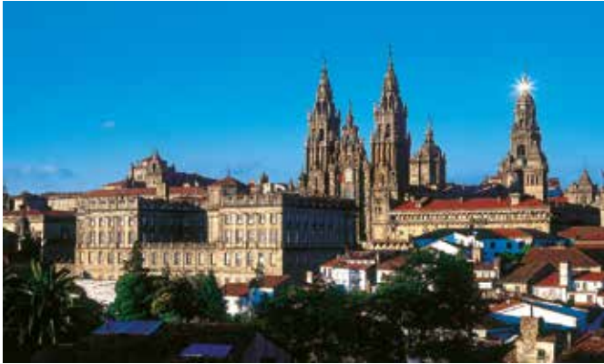
View of Santiago de Compostela

The international airport of Santiago de Compostela (Lavacolla) is 15 km from San Francisco Hotel Monumento, the train station is 1 km away and the bus station, 800 m. from the hotel.