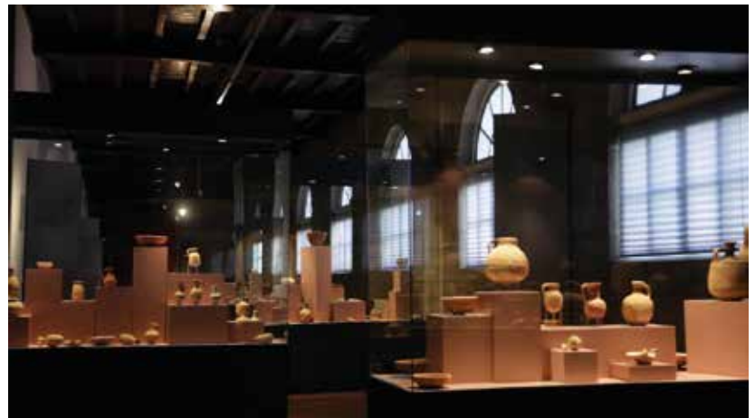
Detail of the Museum of the Holy Land