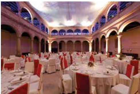
Banquet in the Patio de Cristal