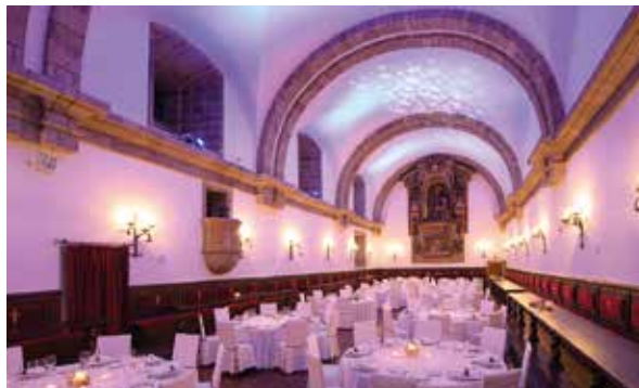
Monumental dining room