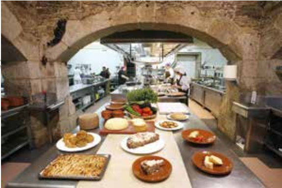
San Francisco's 18 th century kitchen