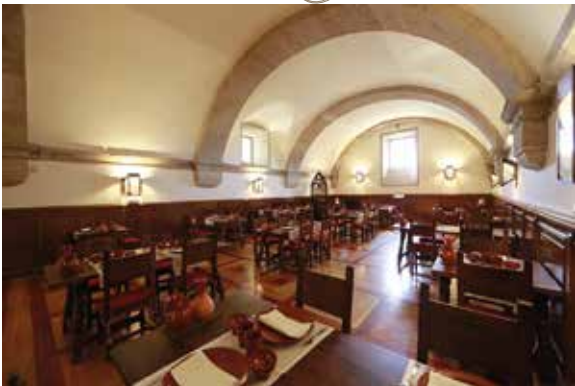
San Francisco restaurant