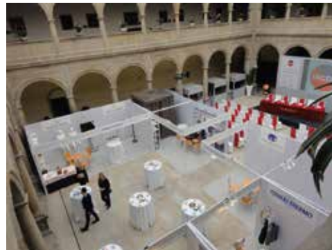
Event in the Patio de Cristal