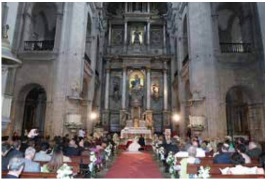
Interior of the Church of Saint Francis