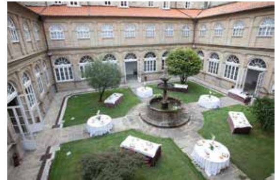
Appetizers in the Cloister of the Fountain