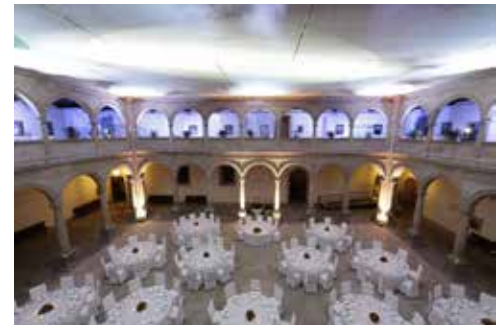
Patio de Cristal