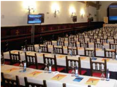
Meeting in the Monumental Dining Room