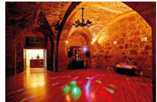
Dance in the wine cellar hall