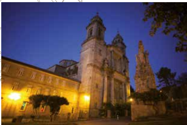
Facade of Saint Francis at dusk