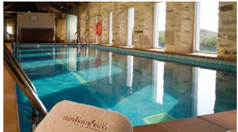
Indoor pool and Jacuzzi