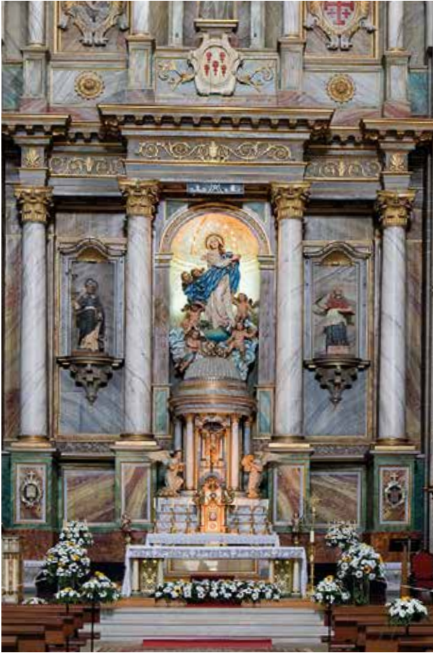
Church of Saint Francis